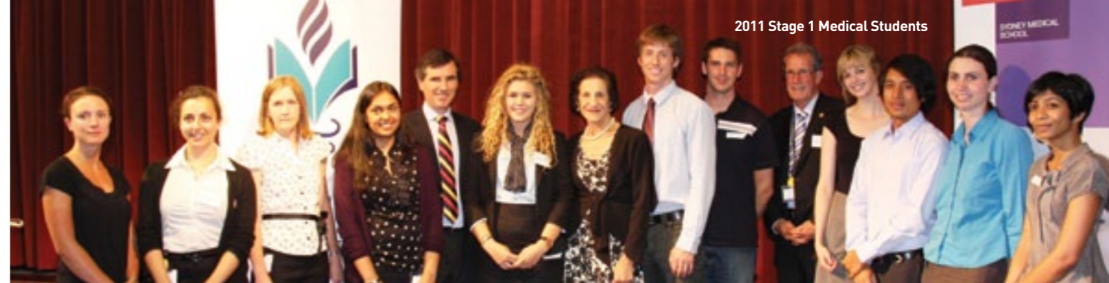
2011 Stage 1 Medical Students