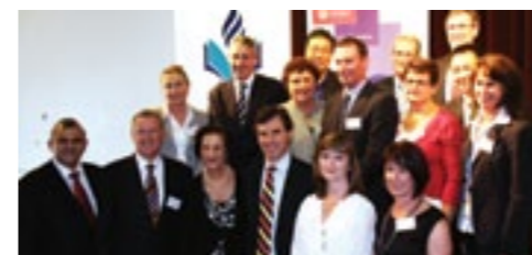
Clinical School Academic Appointments

Her Excellency, Marie Bashir AC CVO, Chancellor of The University of Sydney officially opened the new school.