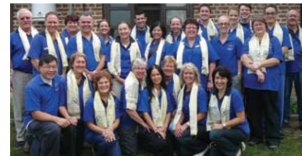
Reconstructive Team, Nepal 2010