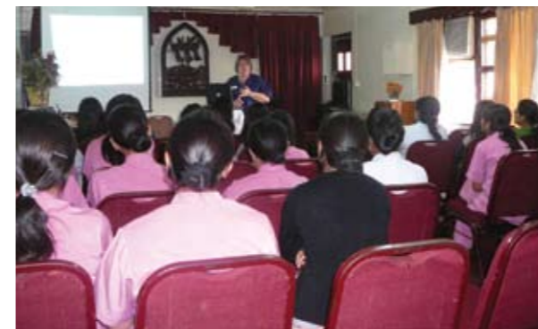
Sharing knowledge and experience.